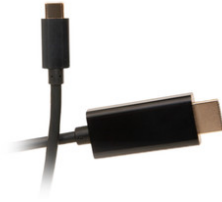
Part # 10U2-34006 - 4K UHD USB-C to HDMI, Phone to UHDTV, 6 foot

What more could you have? Well, maybe we should say, "What could you have less of?"